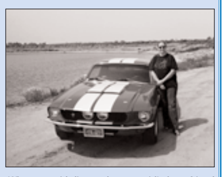
Whoever said diamonds are a girl's best friend obviously did not had the joy of owning a '68 Mustang.

house and casually asked Dad "whose Mustang is that?" His answer-"yours." My first thought was "oh crap... I only have $350 saved up." Well, $200 to the original owner and $45 to the tow company and I was its new owner. I went out into the driveway and there was an instant bond of girl and car. The lifelong friendship had begun.