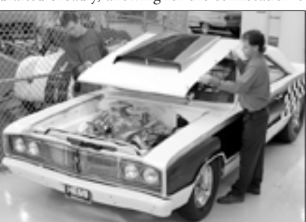
Enthusiasts in Kentucky now have legal protection to finish work on their own hobby cars—as long as the projects are out of public view.

In recent years, states and localities have passed strict property or zoning laws that include restrictions on visible inoperable automobile bodies and parts. Removal of these vehicles from private property is often enforced through local nuisance laws with minimal or no notice to the owner. Elected officials develop these initiatives based on the notion that inoperable vehicles are eyesores that adversely affect property values. Many such laws are drafted broadly, allowing for the confiscation of vehicles being repaired or restored.