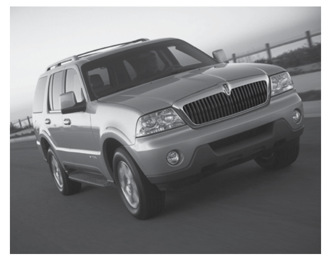
Under recent legislative proposals, truck and SUV owners would be penalized with increased taxes and surcharges.

This has become an ongoing trend as legislators in Hawaii, New York and Vermont are considering proposals that would limit consumer choice by making popular performance and luxury cars, as well as SUVs, light trucks and minivans, substantially more expensive to own and operate. California and