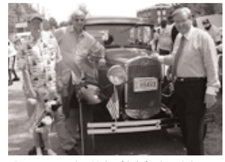
Representative Yuko (right) often jokes that his '31 Ford receives more attention than he does at parades and community functions.

The SEMA Action Network supports legislation that permits the outdoor storage of a motor vehicle if the vehicle is maintained in such a manner as not to constitute a health hazard. These vehicles could be located away from public view, or screened by means of a suitable fence, trees, shrubbery, opaque covering or other appropriate means.