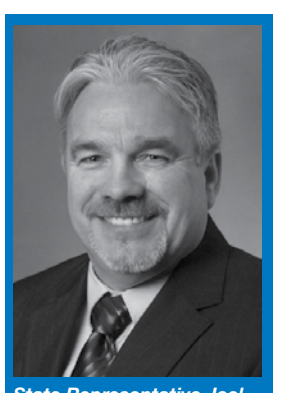
State Representative Joel Sheltrown seeks to add Michigan to the growing list of states who have enacted the SEMA Street Rod/Custom Vehicle bill.

vehicle the same model-year designation as the production vehicle it most closely resembles. Under the bill, vehicles are limited to occasional transportation, exhibitions, club activities, parades and tours and are not to be used for general daily transportation.