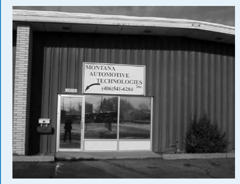
In providing mentors and hands-on training, Montana Automotive Technologies is committed to providing traditional and vocational instruction to Missoula-area youth.