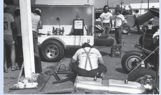
Rod Repair Shop operators were kept busy at the 1973 NSRA National event in Tulsa, Oklahoma.

Since 1951, the Michigan Hot Rod Association (MHRA) has been preserving and promoting the world of modified vehicles. This association was originally formed to fill young enthusiasts' need for a safe and organized place to drag race their hot rods in the state. The world-renowned Detroit Autorama event, founded in 1953 by MHRA, continues to draw crowds from around the world. An MHRA-owned and -operated dragstrip was created in New Baltimore, Michigan, a few years later using the profits from those early hot-rod shows.