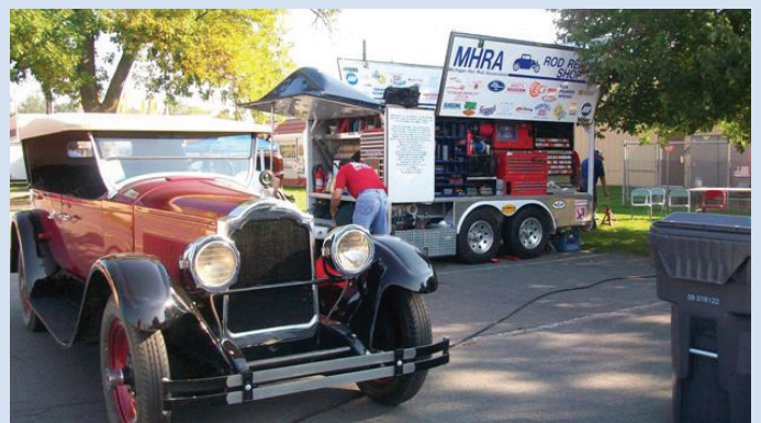
The MHRA Rod Repair Shop trailer sets up at car shows around the country to help keep participant vehicles safely on the road.

As the requests for the Rod Repair Shop Trailer have increased, the tools and equipment have been improved. The original 3,000-lb. trailer was replaced with a custom 9,000-lb. trailer in 1985. Today, the Rod Shop trailer clocks about 5,000 miles each year and provides onsite support for many vehicles. Look for this inspired automotive aide at an event near you!