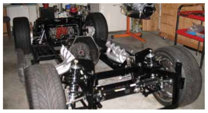
Have your car or truck featured in a future issue of Driving Force. Submit your high-resolution photos online at www.semasan.com

gauges and a chrome roll bar. Best of all, the car's construction and assembly, including its engine, were performed in the garage of his Gadsden, Alabama home. The accompanying photos provide testimony to this Cobra replica's home-built nature.