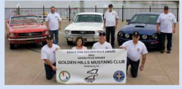
As the Grand Prize winner, Eagle One and associate sponsor Valvoline donated a total of $1,500 to a favorite charity of the Golden Hills Mustang Club

he 180 members of the Golden Hills Mustang Club celebrated after winning the grand prize in the 19th annual Eagle One Golden Rule Awards contest. This prize is awarded annually to the car club with the most compassionate achievement. The Fairfield, California club was honored for sending 75-pound packages of food, toiletries, magazines and other necessities to U.S.