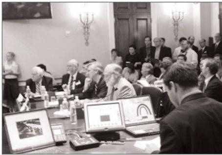
Attendees at a House Resources Subcommittee hearing on Motorized Recreational Use on Federal Land discussed efforts to regulate OHV use on federal lands due to their growing popularity.

"The agencies are currently inventorying the roads and trails, a