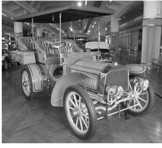
Antique vehicles will benefit from new laws which will provide for expanded use and one-time registration fees.

"Legislators every- prov , where continue to recognize fees .