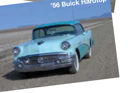
'56 Buick Hardtop

sports Caucus—the federal counterpart to the state Caucus.