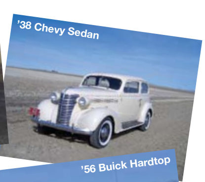
'38 Chevy Sedan