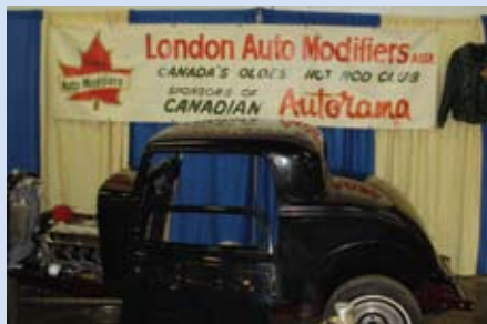
As "Canada's Oldest Hot Rod Club," the London Auto Modifiers are proud sponsors of the Canadian Autorama now in its 51st year.

While always involved in charitable giving, club members wanted to do something special for the hobby. An endowment was created in 2000 enabling the club to start the Don Cook Memorial Award. Named after a founding club member, it awards $500 to up to six local high school graduating automotive students. Applicants must be involved in a verified apprenticeship program to qualify and must use the money to purchase trade-related tools. Club members feel that this not only gives a boost to talented technical students, but it also serves to encourage future hot rodders to get involved in the hobby.