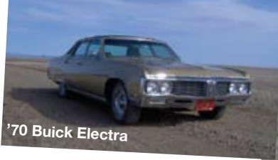
'70 Buick Electra