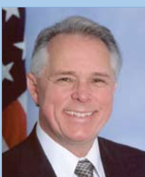
NEW YORK Assemblymember Clifford Crouch