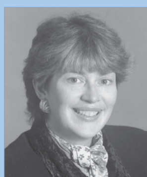
NEW YORK Assemblymember Dede Scozzafava