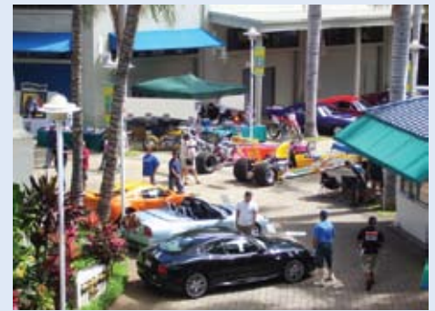
In its second year, the "Build the Track Motorsports Show" helped to raise awareness on efforts to build a race facility in Hawaii.