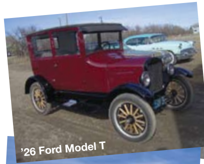
'26 Ford Model T

The evening was topped off by the good news that Senator Tester was joining the Congressional Automotive Performance and Motor-