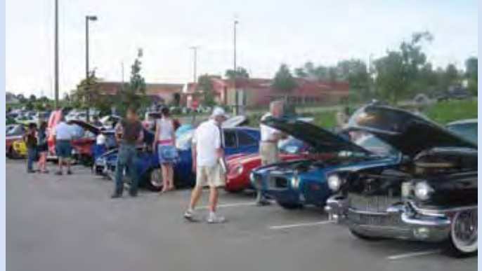
Attendees admire cars on display for last year's show to benefit the American Lung Association.

Last year, the Coalition put on the First National Bank Corporate Cup Committee's Car Show with proceeds benefitting the American Lung Association. Fifty cars participated and prizes were awarded in the following categories: Ford, Mopar, GM, Truck, orphans (such as Olds and Pontiacs) People's Choice and Ambassador's Choice. The Ambassador's Choice was awarded to a '72 Detomaso Pantera. This year's Show is scheduled for June 4 and will again benefit the American Lung Association.