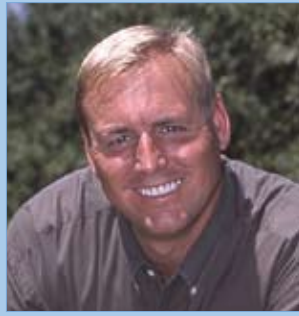
CALIFORNIA State Senator Jeff Denham

* Visit www.semasan.com for a complete list of caucus members.