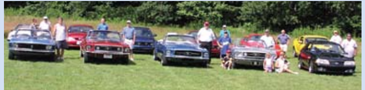
Members of the Valley Forge Mustang Club show off their prized collections at a recent club picnic.