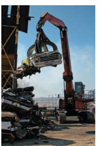
Scrappage programs deprive the classic-car hobby of vehicles which can be restored or parts for other vehicles undergoing a restoration.

Utah Aftermarket Exhaust Systems: The SAN defeated a bill to ban the use of most aftermarket exhaust systems. Under a substitute bill, all vehicles would have been required to be equipped with an exhaust system that is "installed by the original manufacturer of the vehicle and is not modified; or meets specifications equivalent to the muffler installed by the original manufacturer of the vehicle and is not modified." Among other things, the measure ignored the fact that aftermarket exhaust systems are designed to make vehicles run more efficiently without increasing emissions; did not supply law enforcement with a clear standard to enforce, allowing them to make subjective judgments on whether or not a modified exhaust system is in violation; and would have made it difficult for hobbyists to replace factory exhaust systems with more durable, better-performing options.