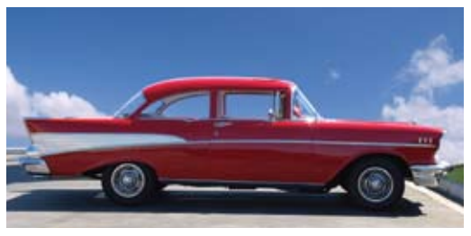
Many older vehicles are second or third cars, which are rarely driven and deserve a reduced registration fee from

Oklahoma Legislature to reduce the annual registration fee for vehicles 25 vears old and older to $5. Under current law, these vehicles are assessed at a rate of $15 per year.