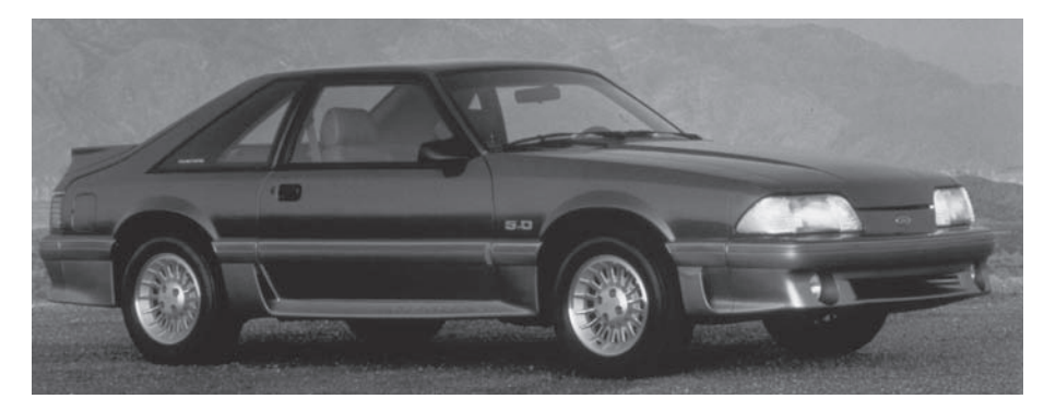
California lawmakers are attempting to lure post-'76 collector vehicles into early retirement through annual emissions testing.