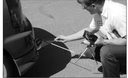
SEMA-model legislation provides for the testing of exhaust noise through a standard (J1169) adopted by the Society of Automotive Engineers. To be certified under the SEMA model, vehicles may not exceed 95 decibels.