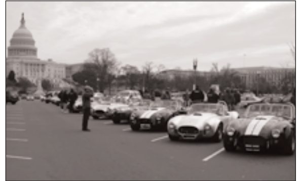
Members of the Capitol Area Cobra Club helped to enact legislation in Virginia which creates new titling and registration classes for replica vehicles