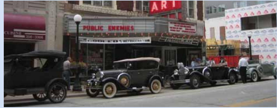
The Illini Collector Car Club participated in a vintage vehicle display outside of the Public Enemies movie premiere in downtown Champaign, Illinois.