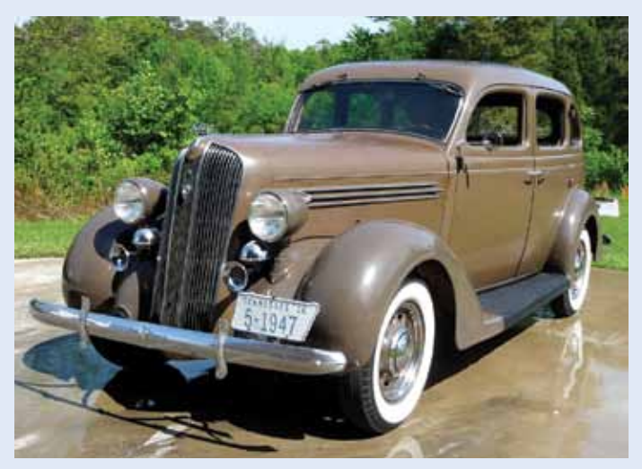
Have your car or truck featured in a future issue of Driving Force. Submit your high-resolution photos online at www.semasan.com

unlike today's cars where we can become lazy and easily distracted with all of the comfort and technological amenities. I have had several people ask me if I'm going to street-rod the '36, and my response is and always will be, "they're only original once."