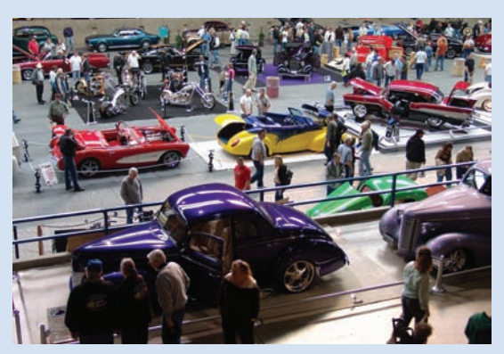
Through proceeds of the annual Southern Oregon Rod & Custom Show, the Rogue Valley Street Rods has donated $380,000 to local charities.

This charity car show was first presented in 1978 and has grown in size and quality every year since. Through last year's event, the club has donated some $380,000 to charity. The funds are used by the Child Development and Rehabilitation Center (CDRC) of Oregon Health Science University to treat southern Oregon kids with diagnoses, such as cerebral palsy, spina bifida, developmental delay, craniofacial disorders, genetic synthe funds to provide the kids with such items as wheelchairs, van modifications for wheelchair lifts, computers Golden Rule Award program. and special therapy.