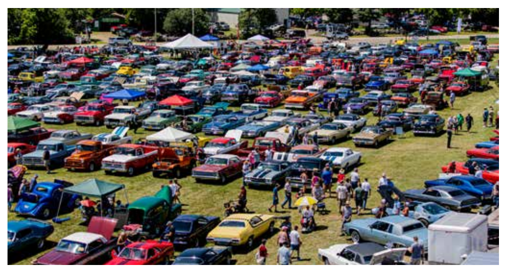
This July, automotive enthusiasts will celebrate the eleventh annual Collector Car Appreciation Day holiday.

As in years past, a wide range of automotive festivities are planned to commemorate the occasion. With an understanding that this summer may not allow in-person events, adjustments to the CCAD online tools are underway to accommodate web-based celebrations. Those planning to pay tribute with a virtual gathering (online event, livestream, digital gallery, etc.) are welcome to provide details for inclusion on the SAN website. As always, the SAN welcomes any level of participation throughout the month of July and encourages everyone to spread the word about honoring the classics of the past and the future.