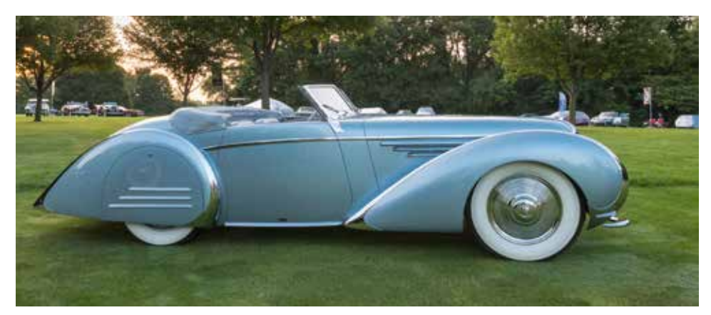
"Old cars" have steadily become synonymous with dollar signs in the eyes of many public officials. Often, proposals aimed bankrolling vintage vehicle owners are drafted without regard for nuance—such as the contrast between a Concours-level Delahaye, as pictured here, and a beloved hand-me-down El Camino.

The latest efforts targeting classic automobiles included Maryland, Washington and Wisconsin. Maryland's vehicle owners are well aware of the state's history with the